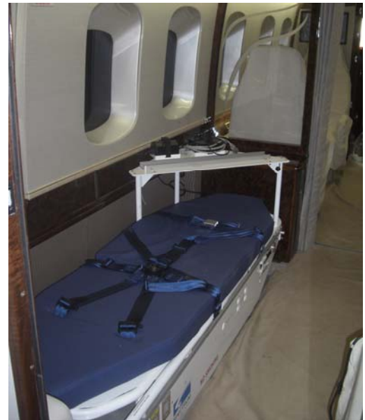
Single 2800 Series System Install