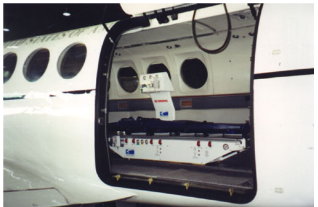
2800 Series System