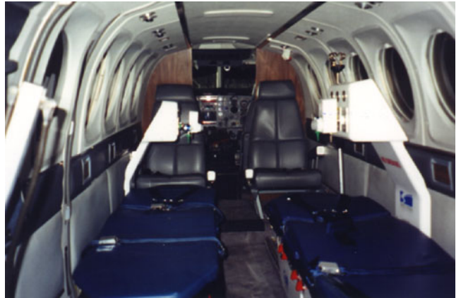
Dual 2800 Series System Install

*Contact a Sales Representative for further Install Details