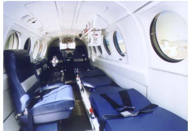
Dual Dedicated System Install

*Contact a Sales Representative for further Install Details