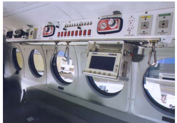
Dedicated Overhead Panels