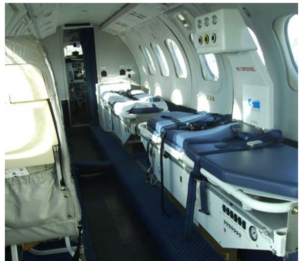
Dual 2800 Series System Install