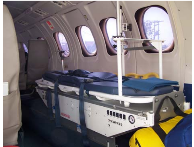
Single 2800 Series System Install with Stretcher Bridge

*Contact a Sales Representative for further Install Details