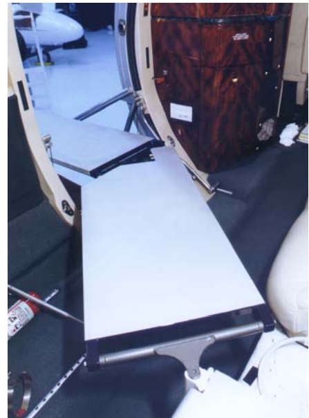
Loader Transition Table