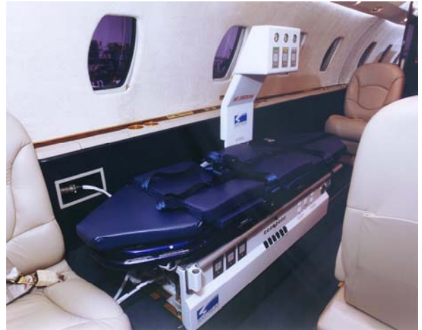
Single 20 Series System Install