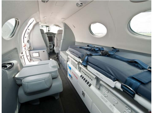
Single 2200 Series System Install