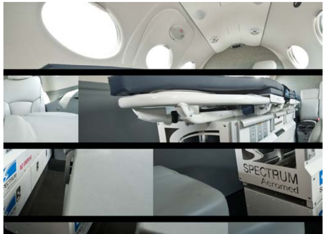
2200 Series System Base