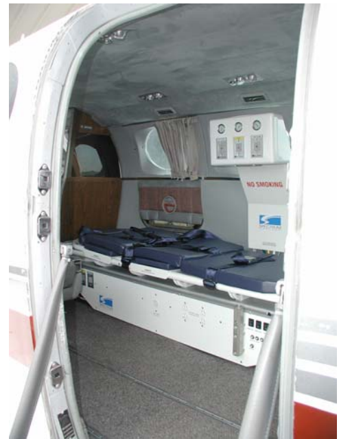
Exterior View of 2800 Series System

*Contact a Sales Representative for further Install Details