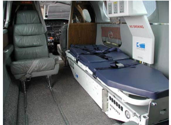
Single 2800 Series System