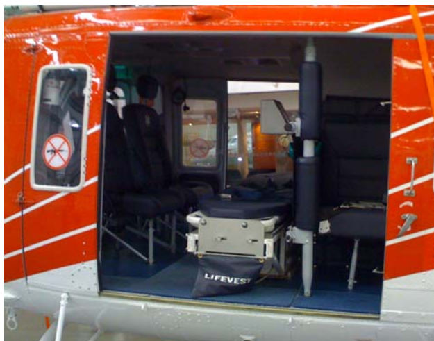
Outside View- Single 2800 Series