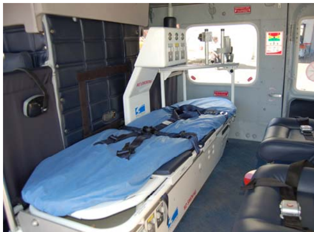
Single 2800 Series System Install

*Contact a Sales Representative for further Install Details