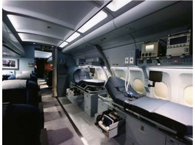
5500 Series System Install with Drawers

*Contact a Sales Representative for further Install Details