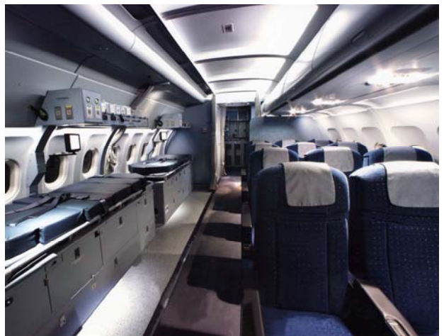
5500 Series System Install