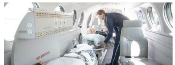
Dual Installation Right Side

1815 23rd Avenue North • Fargo, ND 58102