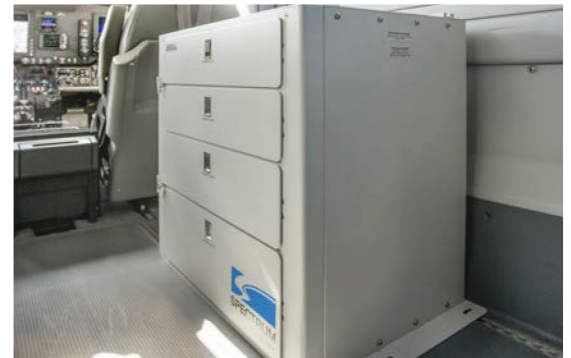
4-drawer cabinet installed