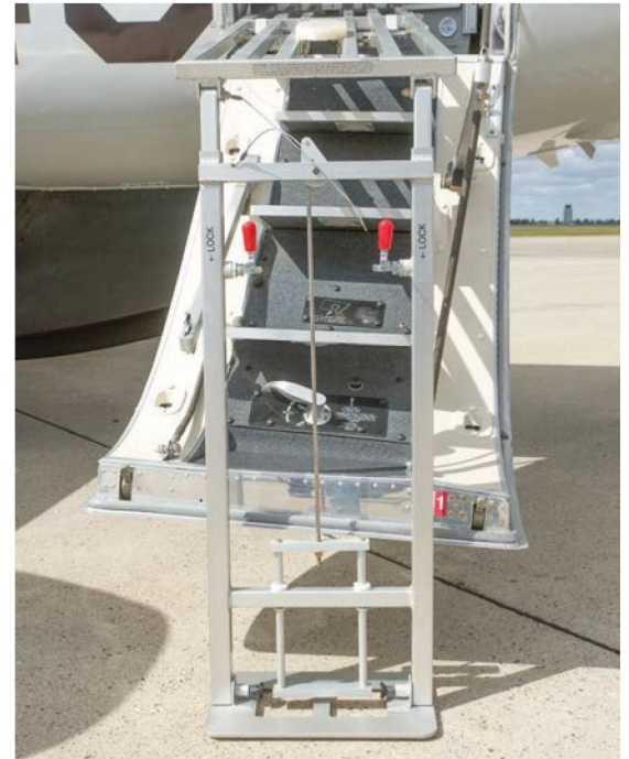
Manual loader on KA350