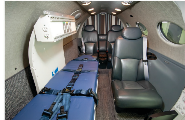
2200 with Medwall