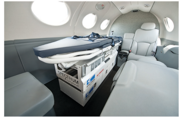
Single 2200 Series System