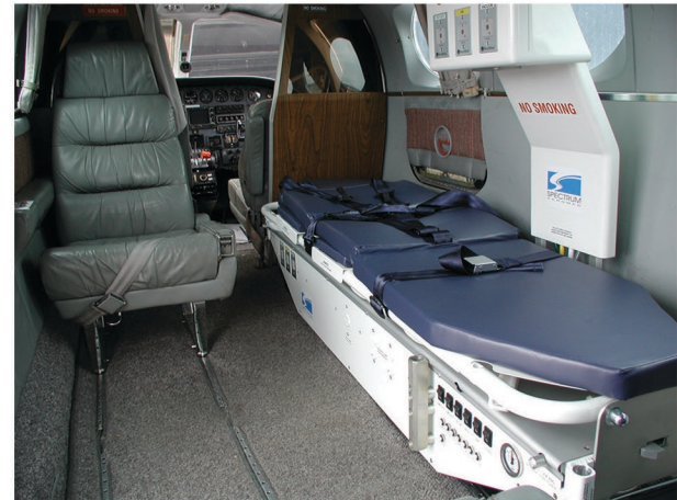
Single 2800 Series System