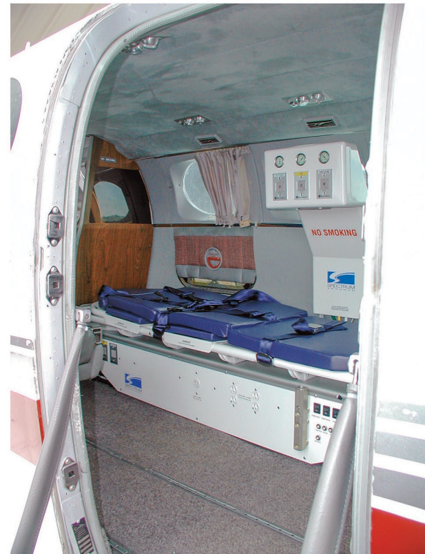
Exterior View of 2800 Series System

1815 23rd Avenue North • Fargo, ND 58102