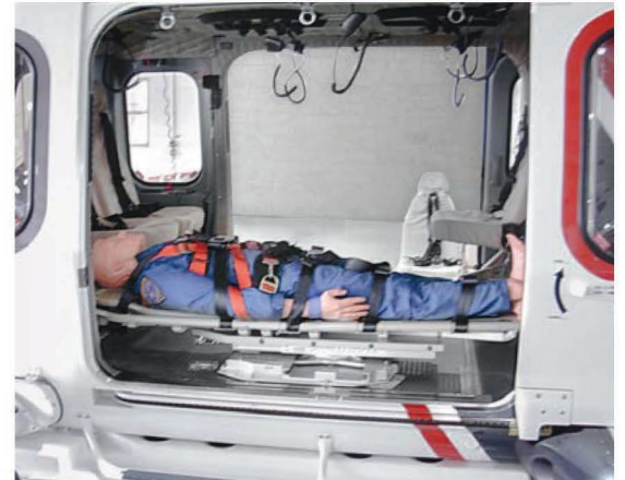
Pivot base installed longitudinally and laterally in the aircraft.