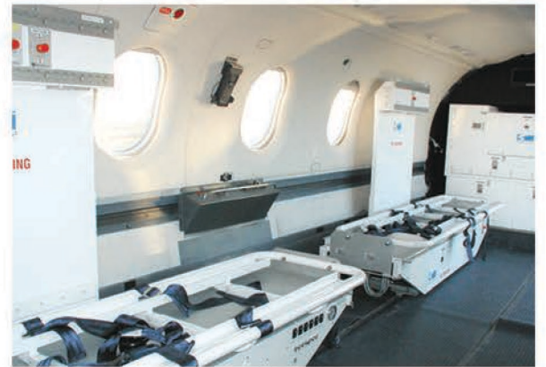
Dual 2800 Series System Install