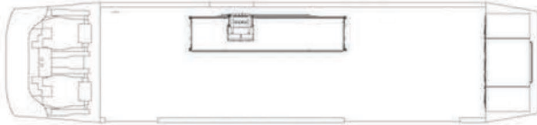
Single 2800 Series System Install with Cabinets

Spectrum Aeromed is recognized as a world leader in creating customized and durable, highly functional air medical transport equipment that complies with aviation regulations. All engineering and design of our air ambulance life support systems comes from working hand-in-hand with air medical personnel worldwide.