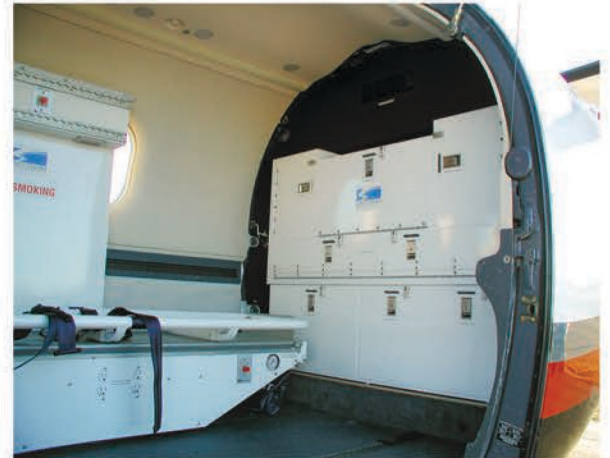
Single 2800 Series System with Med Wall and Cabinets