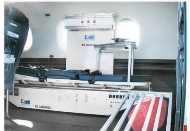
Stretcher and Base Install

1815 23rd Avenue North • Fargo, ND 58102