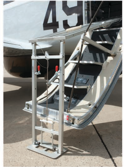
Manual Loader on KA350