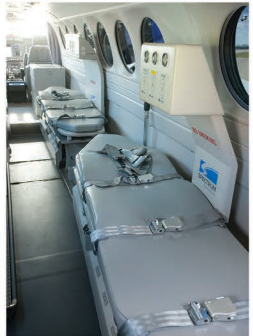
Dual Installation Right Side

1815 23rd Avenue North • Fargo, ND 58102